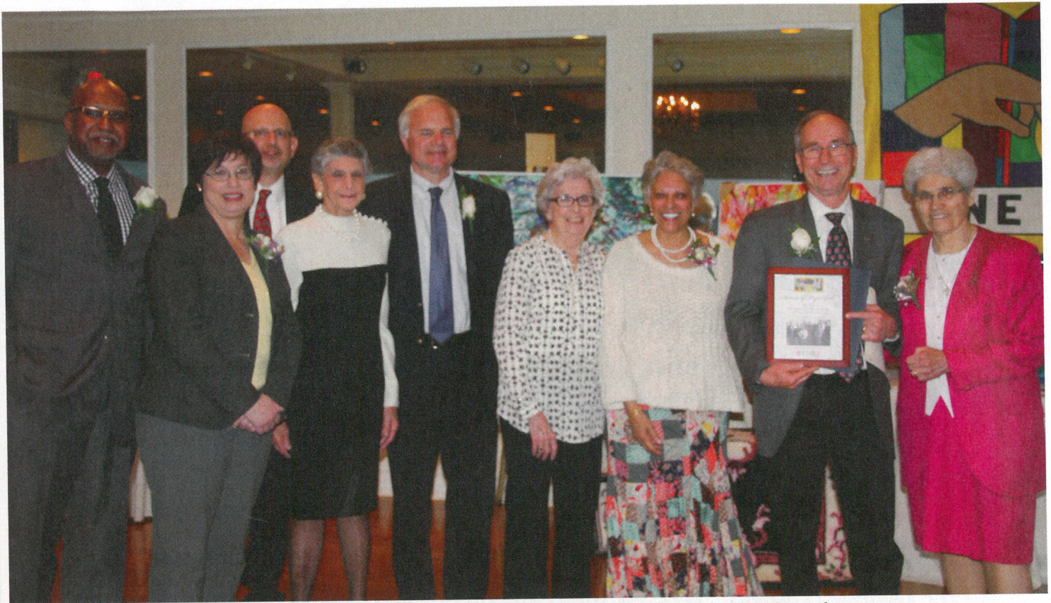
Members of Nyack Rotary were awarded the Humanitarian Award.