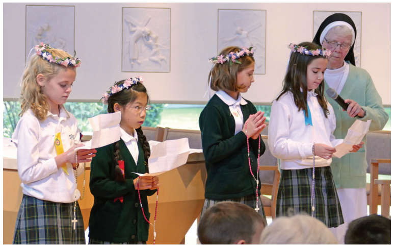
ABOVE: Students from St. Paul School