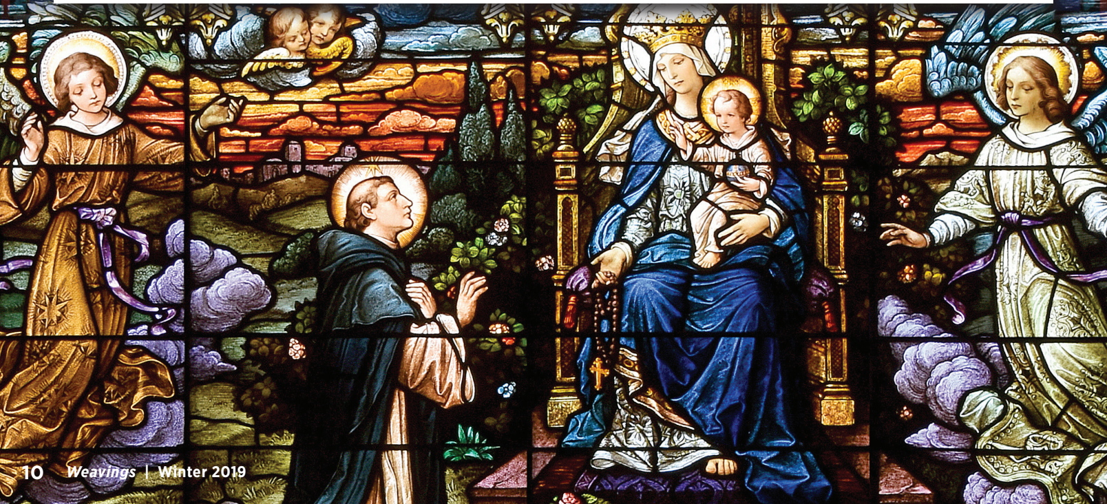
BELOW: Stained glass window from Sacred Heart Chapel on grounds of Dominican Convent