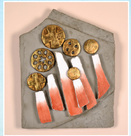
SISTER ADELE MYERS, OP | 2007